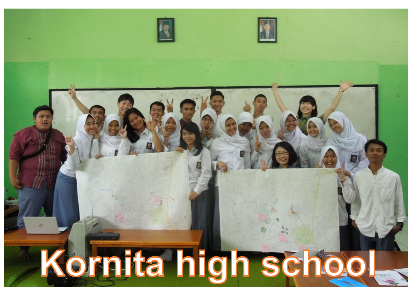
Kornita high school