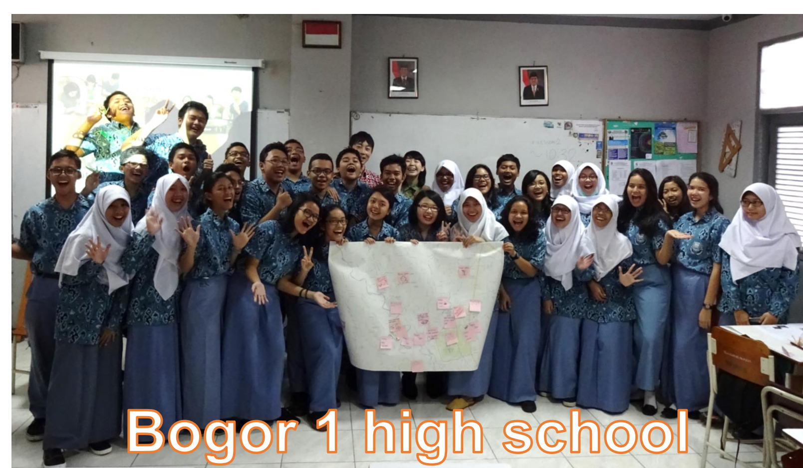
Bogor 1 high school